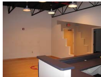
customized waiting room